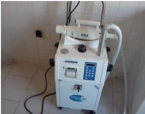
Fig. 1. A nebulizer with dry saturated steam: Sani System Polti

Disinfection equipment distributed by the company MIVA was a fogging system saturated vapour and a sanitizer. Sani System is an electro-medical device which delivers saturated steam at high temperature (180°C) associated with the sanitizing HPMed. Its uniqueness lies in the fact that the steam is brought to a high temperature in an expansion chamber (Fig. 1).