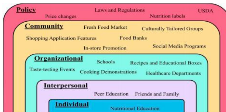
Fig. 1. Multilevel approaches to increase healthy food consumption in low-income populations, based on the SEM (Ziso et al. 2022)

Conversely, (Ziso et al. 2022) used the framework of the Socioecological Model (SEM) concept, as outlined by the Centers for Disease Control and Prevention to summarize the main multi-level approaches discussed in this review for improving food security and nutritional status (See Fig. 1). Health education programs applied with a multilevel interaction approach have greater effectiveness for food security. In this case, interaction first occurs on a personal level with an individual, then extends to the creation of a support system including family, friends, and social networks (Ziso et al. 2022). Other more impactful resources that might help this population include those through schools or workplaces, communities considering cultural values and norms, and policy changes from local laws to national changes.