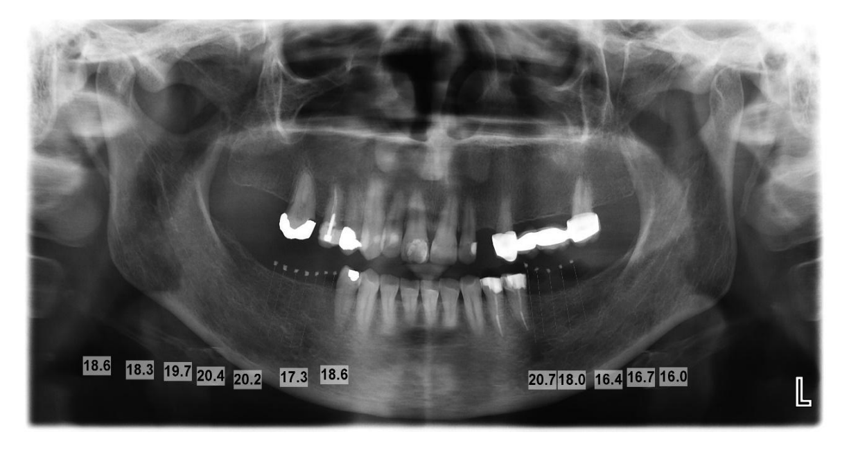
Fig. 1. Panoramic radiography and measurement of specified points

Stata 14 statistical software was used for data analysis. To describe the data, depending on the distribution of variables, central indices including mean and median and scatter indices including standard deviation and interquartile range are used. To compare the average available bone length for implant placement with two methods of panoramic and CBCT Paired T -test was used (P \alpha = 0.05).