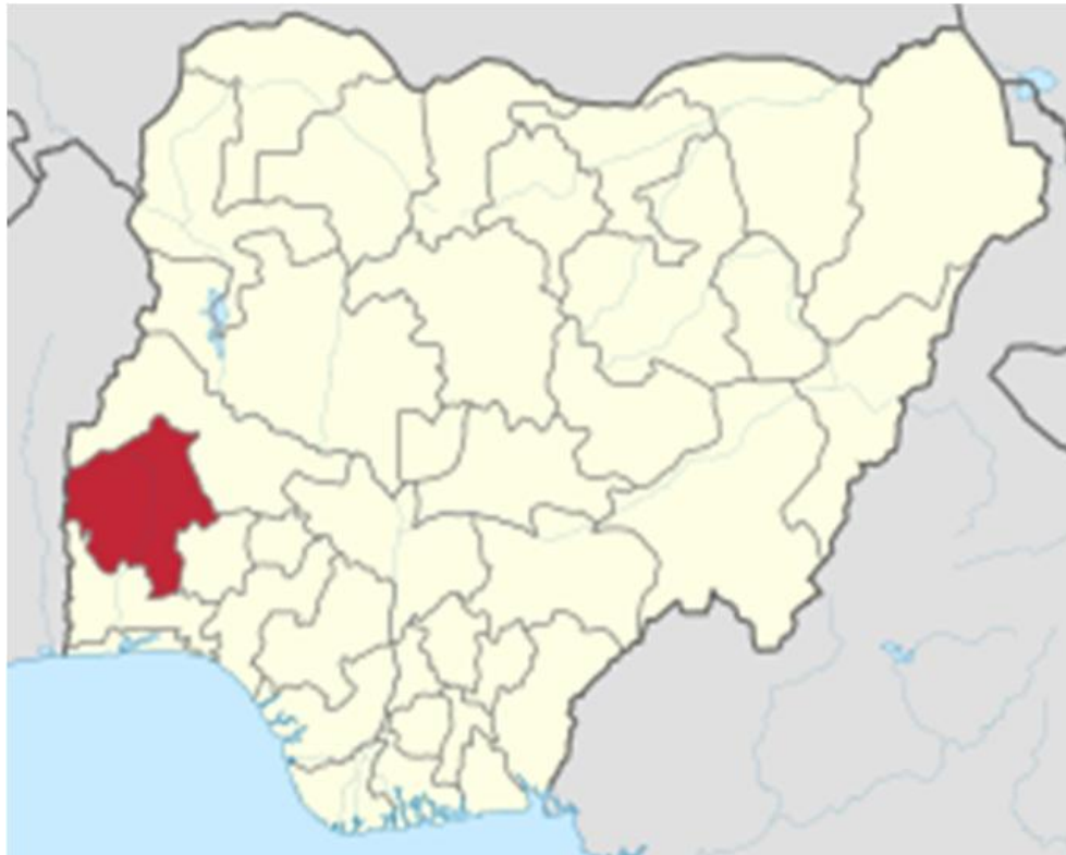
Fig. 1. Map of Nigeria showing Oyo state with Ibadan

A list of fifteen (15) activities done during training was presented to respondents from which respondents were to indicate their level of participation based on whether they were: very active = (2), slightly active = (1) and not at all = (0). The mean scores were computed to rank items according to the level of participation by respondents from the greatest to the least in participation. The mean score (17.02) was used to categorise respondents' into high and low participation in training of modern beekeeping technologies.