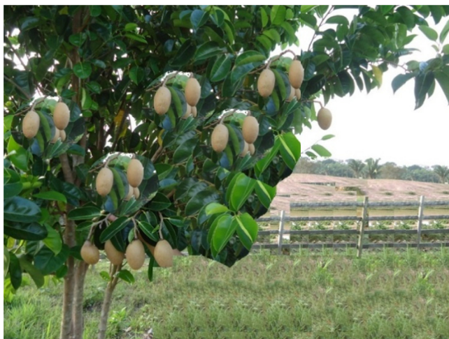
Figure 1. Castanha-de-cutia tree with oil from the Castanha-de-cutia almond