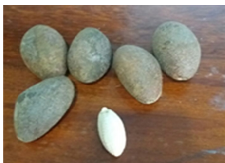
Figure 2. Amazonian oleaginous fruits of the Castanha-de-cutia tree

According to the Food and Agriculture Organization of the United Nations (FAO, 1987), the species is endemic to the central region of the Brazilian Amazon, between the municipalities of Tefé and Coari on the Amazon River, and can also be found on the Solimões, Trombetas, Ituí rivers, and in the municipality of Atalaia do Norte (Leandro et al., 2014).