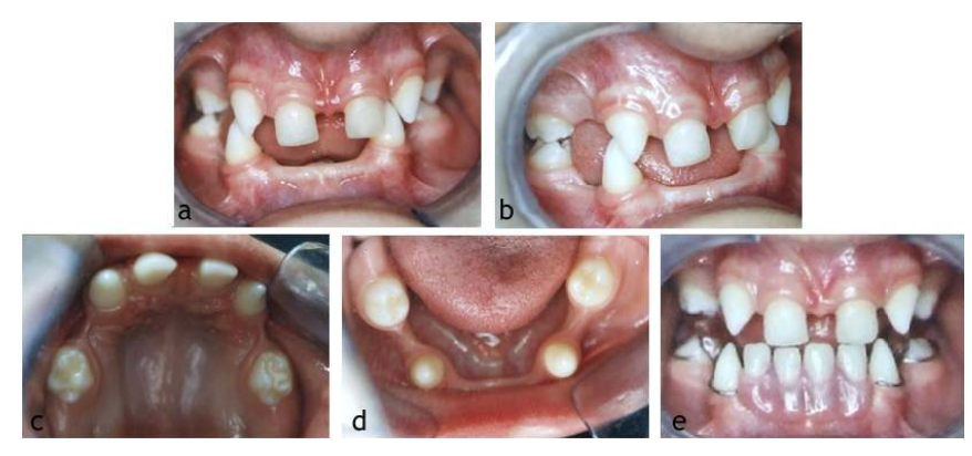
Fig. 1. Intraoral photographs of a 5-year-old boy with HED. (a, b) View of occlusion with reduced VDO and excessive vertical overlap, (c, d) intraoral view of maxilla and mandible, and (e) the occlusion after the placement of a mandibular RPD with wrought wire clasps and an acrylic plate for bilateral occlusal coverage of posterior teeth. (Patient of the Postgraduate Clinic of Orthodontics, treated by the authors)

For cooperative children, removable prostheses inserted as early as possible improve oral function, support the vertical height and prevent abnormal mandibular posture during growth. The vertical and anteroposterior impairment of HED patients can be overcome with removable prostheses, provided that the dentures maintain proper vertical and anteroposterior relationships [30]. To achieve this goal, the dentures have to be comfortable and stable (Fig. 1).