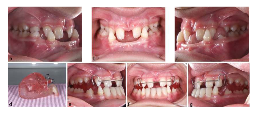
Fig. 3. Intraoral photographs of a 11-year-old boy with HED. (a, b, c) View of the occlusion with excessive overbite and Class III skeletal relationships, (d) the functional orthopedic appliance for the control of the overbite and the improvement of the skeletal discrepancy along with artificial mandibular incisors for the esthetic improvement, and (e, f, g) view of the occlusion with the functional appliance. (Patient of the Postgraduate Clinic of Orthodontics, treated by the authors)

that HED patients with marked maxillary deficiency who possess sufficient number of posterior teeth to serve as attachments may benefit from the adjustment of face mask (Fig. 5). Thus, an orthognathic surgery in the end of growth and the skeletal maturity to normalize skeletal jaw relationships may be avoided.