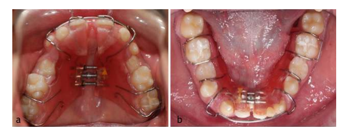
Fig. 4. (a) The maxillary transversal expansion with a removable device equipped with a 2directional jackscrew, (b) the expansion device at the mandible with artificial mandibular incisors for space management and esthetics. (Patient of the Postgraduate Clinic of Orthodontics, treated by the authors)