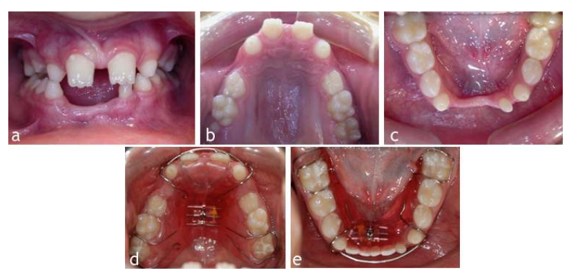
Fig. 2. Intraoral photographs of a 7-year-old boy with HED. (a) View of occlusion showing the restricted transversal growth and the anomalous development of anterior mandibular alveolar ridge, (b, c) view of maxilla and mandible, and (d, e) view after the positioning of orthodontic appliance with a 2-directional jackscrew at the maxilla and the mandible. (Patient of the Postgraduate Clinic of Orthodontics, treated by the authors)

The goal of the treatment in the late childhood years is to maintain and monitor the oral function. Growth is less rapid than in early childhood, but the progress of vertical, sagittal and transversal facial growth should be monitored; as natural deciduous teeth are gradually lost, esthetic needs appear and need to be addressed.