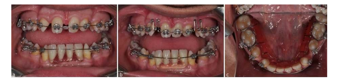
Fig. 7. (a, b) Fixed orthodontic appliances for teeth uprighting, alignment and space redistribution in maxilla and mandible. (c) Removable orthodontic appliance in combination with fixed orthodontic appliances to support anterior mandibular artificial teeth. (Patient of the Postgraduate Clinic of Orthodontics, treated by the authors)

During adulthood growth continues, but in low rates [19]. Small changes affecting the three planes of space are sometimes noticeable and have to be monitored. At this time of residual growth, RPDs or CDs are still constructed and accommodate the changes of the jaws. Orthodontic fixed appliances may also be used in order to stabilize the spaces between teeth, and prevent their overeruption or tilting. The multidisciplinary team discusses the definite treatment options, the patient is presented with the definite restoration alternatives, and the final prosthodontic treatment plan is elaborated, including the necessary pre-prosthetic surgical and/or orthodontic procedures [8,56,70]. For example, orthognathic surgery may be advised, combined with orthodontic intervention, to correct the anteroposterior skeletal discrepancies and to improve the concave profile of HED patients, providing a favorable background for the final prosthodontic rehabilitation [72,73]