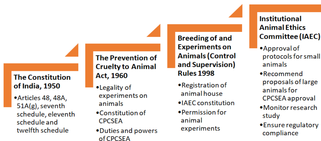
Fig. 2. Origin and functions of institutional animal ethics committee

In-vitro studies are another commonly used alternative to animal models. It involves evaluation of drug activity using cell lines grown outside the living organism. The cells of various organs are collected from animals and are then grown on special media outside the body. These cell lines are used for preliminary screening of toxicity and efficacy studies of test drugs [22-23]. The main limitation of cell line studies is the unavailability of in-vitro cultures for most of the target organs [17].