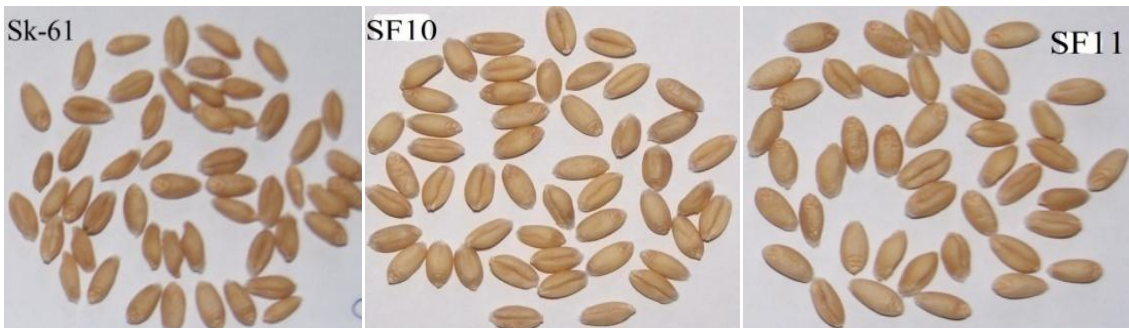
Fig. 6. The heaviest grains shown by SF10 and SF11 as compared with the better parent Sakha-61