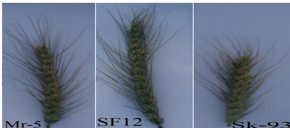
Fig. 7. The longest and heaviest spike of SF12 as compared with the better parent Maryout-5 and Sakha-93