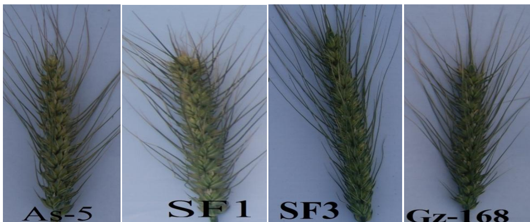
Fig. 1. The highest number of grains/spike for SF1 and SF3 as compared with their parents As-5 and Gz-168, respectively, and the longest spike for SF3

to water stress. It is characterized by the longest and heaviest spike (Fig. 7).