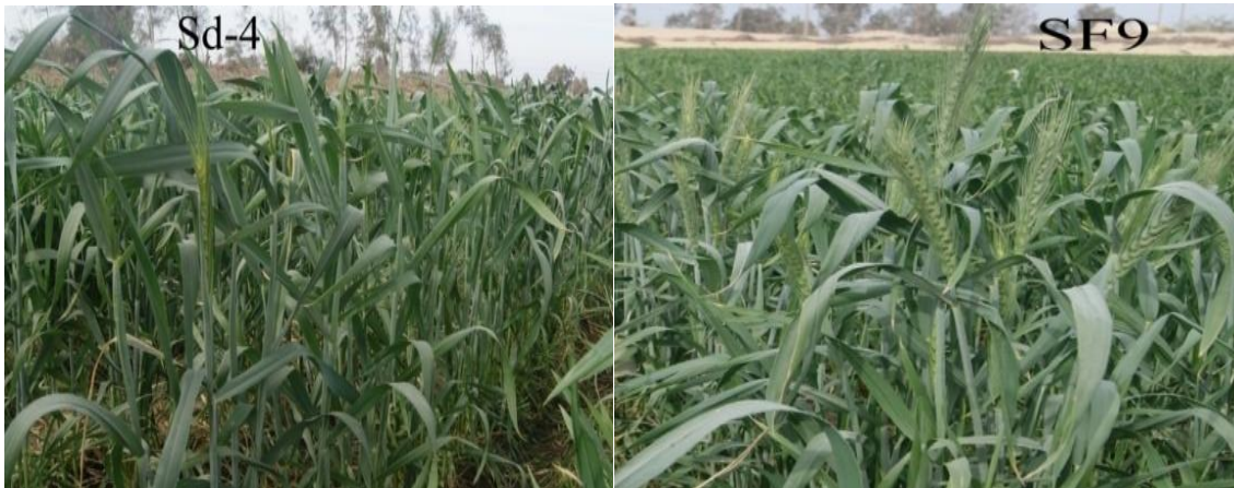
Fig. 5. The earliest heading shown by SF9 as compared with the better parent Sids-4