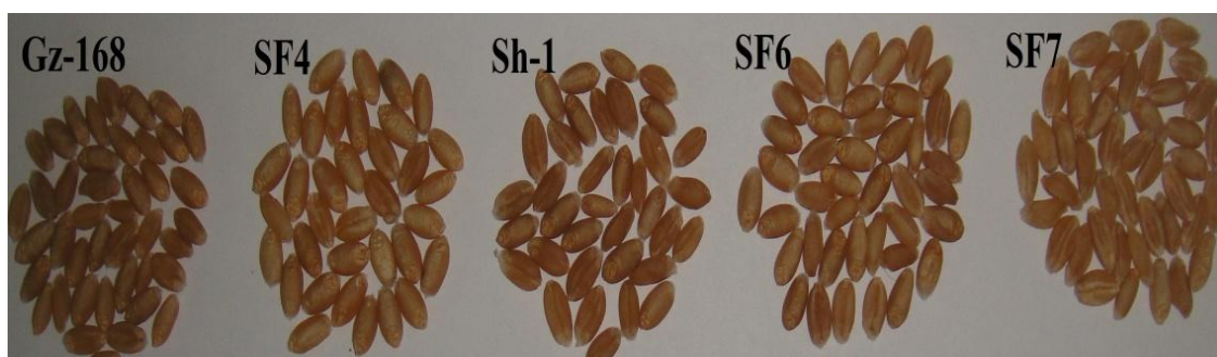
Fig. 3. The grains of SF4 and (SF6 and SF7) as compared with their parents Gz-168 and Sh-1, respectively