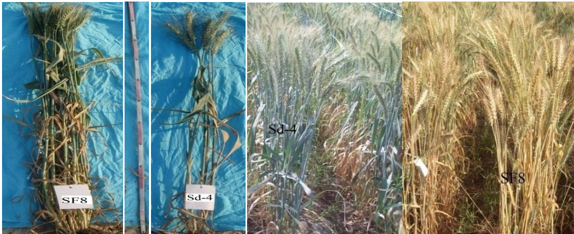
Fig. 4. The earliest maturity and tallest plant shown by SF8 as compared with the better parent Sids-4