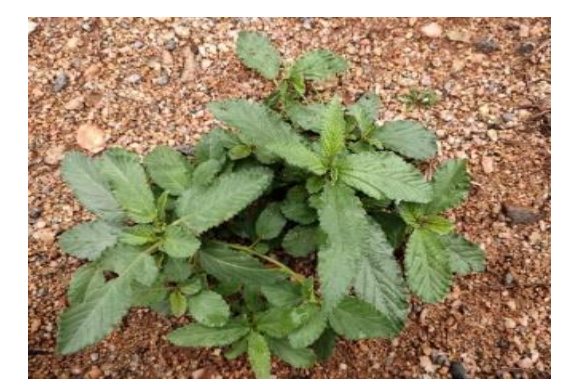
Fig: 1a Corchorus olitorius

The results of colour scores of chutney powders were presented as L*, a*, b*, C* and h* values (Table 2). L* values of chutney powders were 61.16±0.88 (ICC) and 59.88±0.49 (ICO). The a* and b* values of ICO were 5.21 and 23.71 respectively. The L* values of chutney powders were decreased by 2.09% in ICO than the control sample. There was no significant difference was found between the control and ICO for the L* and E* values. Hunter colour values L*, a* and b* indicates that ICO possessed green colour. The water activity is inversely proportional to shelf life of the products. The water activity of Corchorus olitorius incorporated chutney powder was less than 0.5 and so the product can be best stored at room temperature.