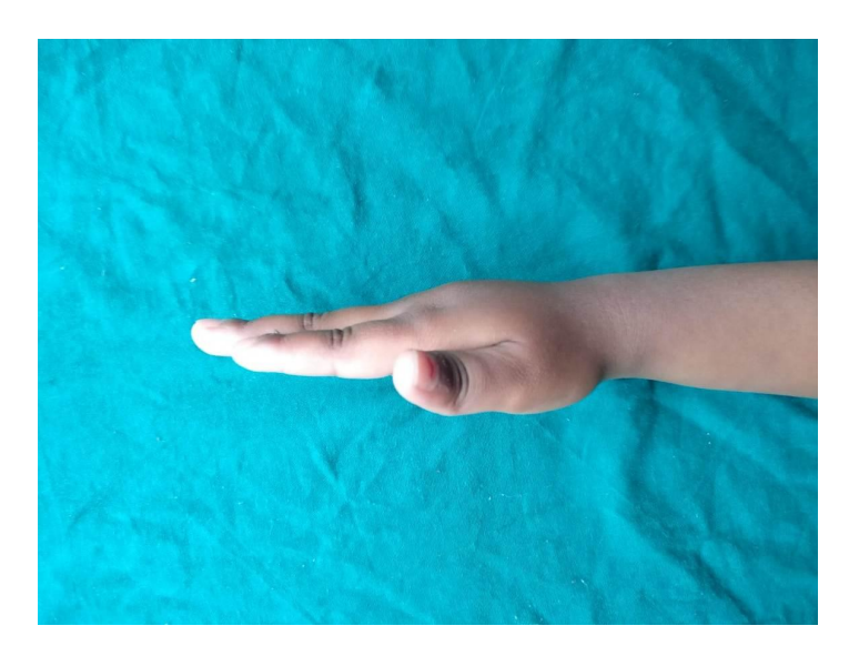
Fig. 4 Clinical pics post ATT at one year