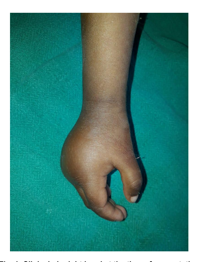
Fig. 1. Clinical pic right hand at the time of presentation