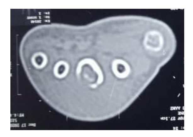
Fig. 3. CT Scan showing lytic destructive area 3<sup>rd</sup> metacarpal bone, flaring of medullary cavity with destruction