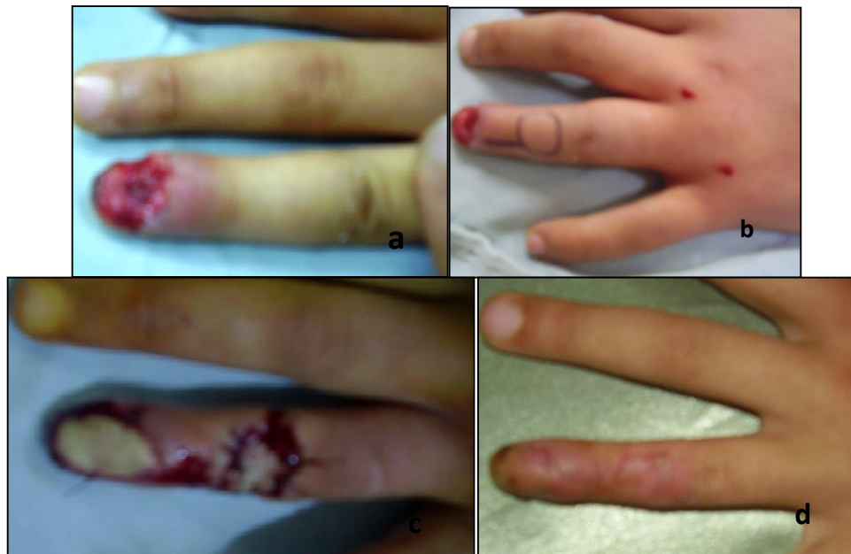
Fig. 2. a. loss of dorsal tissue of the third phalanx b. preoperative design of the flap c. coverage by an adipofascial pedunculated flap harvested from the dorsal tissue of the second phalanx, donor site grafted at the same time d. aspect of the finger after 2 months

The loss of substance being dorsal in all cases, in relation to the first phalanx in 3 patients, to the second phalanx in 4 patients, to the proximal inter-phalangeal joint in one patient and to the third phalanx in two patients.