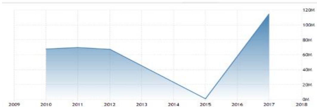
Fig. 3. Sudan exports of Gum, lac and resins

According to the COMTRADE database of United Nations on international trade, Sudan exports of oilseed, fruits, oleaginous and grain was US$607.45 million in 2017.