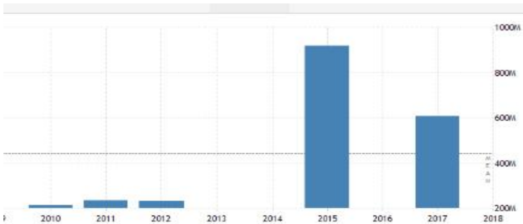
Fig. 2. Sudan exports of oil seed, oleagic, fruits, grain and seed