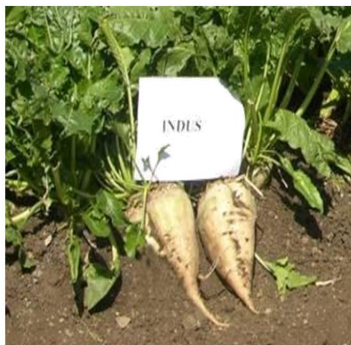
Genotype Indus at October I FN sowing