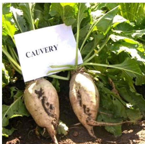
Genotype Cauvery at October I FN sowing

Significantly lower impurity index was observed in October I FN sown crop (282) compared to other dates of sowing. The genotype Cauvery (393) recorded significantly lower potassium content than Indus. Interaction effect between sowing dates and genotypes was not significant for potassium content in tubers.